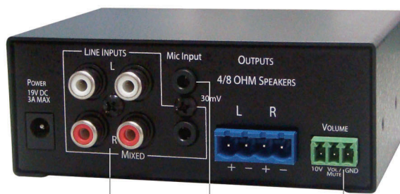
Line Inputs Mixing Two line-level stereo inputs on RCA connectors plus one line-level stereo input on a 3.5mm mini-jack signals are mixed inside the amp at a 1:1:1 ratio.