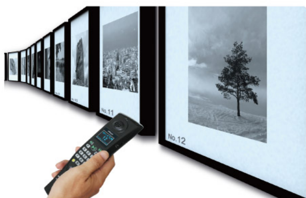
Traditional keypad (Non-directional)