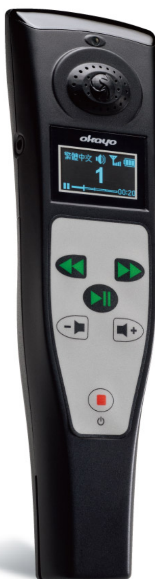
AT-300 linear guide